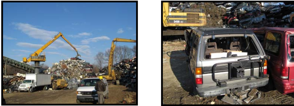
Figure 1: Hard Drive Destruction at the Recycling Facility